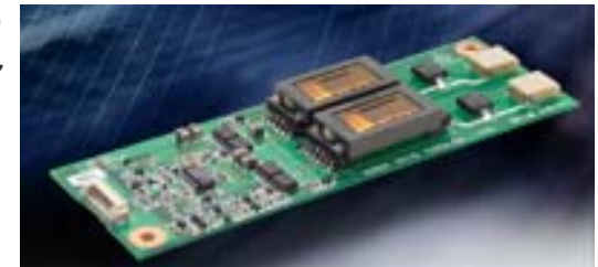
Taiyo Yuden KLS150a Inverter

Click on part number to view inverter specifications online.