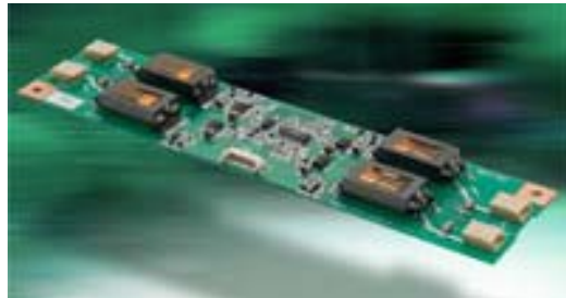
Taiyo Yuden KLS170a Inverter